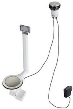
Space Light automatic waste fitting - PL 8407 117